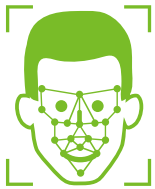
Access Control System

Our Pro M series tripod turnstiles represent classic and safe way to protect your premises. They are used in various indoor environment applications. They fit perfectly as an economical option in the office buildings and other related applications.