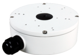
A22 JUNCTION BOX